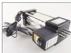
Large capacity two-level ink box with electromagnetic valve