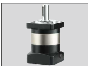
Auto up & down motor of carriage