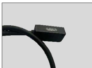
High-precision magnetic grid