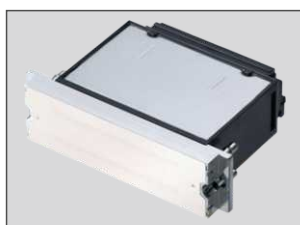
RICOH G6 Print Head