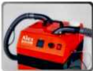
DOUBLE TRIMMING HEAD - DOUBLE MOTOR