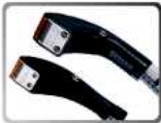
THE SUCTION AND CUTTING FUNCTION ARE INTEGRATED AND THREAD IS CUT CLEAN