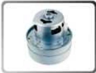
BRUSH LESS SUCTION MOTOR